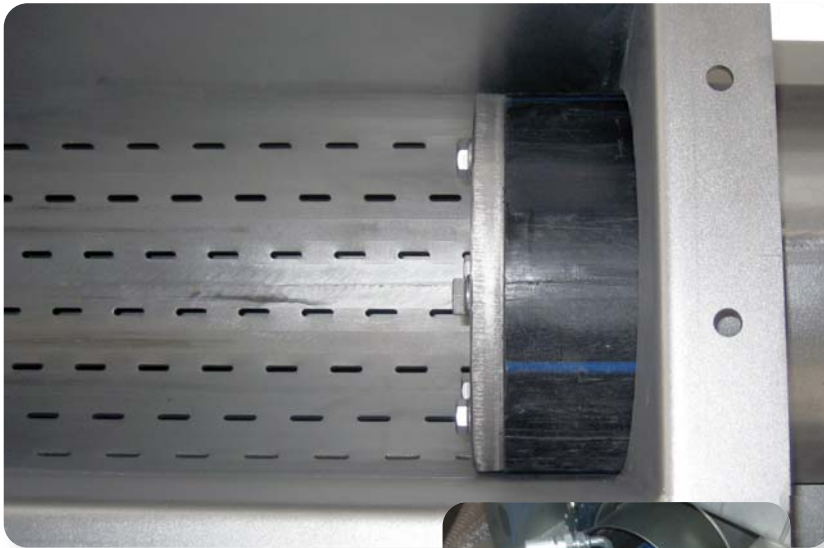
Piston with sleeve and slotted dewatering zone